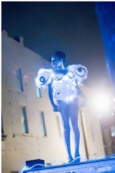
IMAGE CREDITS: top to bottom: Wearable Art model, InLight Richmond 2009; Wearable Art model, InLight Richmond 2008, photo by Terry Brown