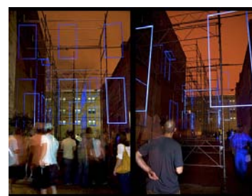
InLight Richmond 2009

This exhibition documents the artistic career of a pivotal figure in the Richmond arts community.